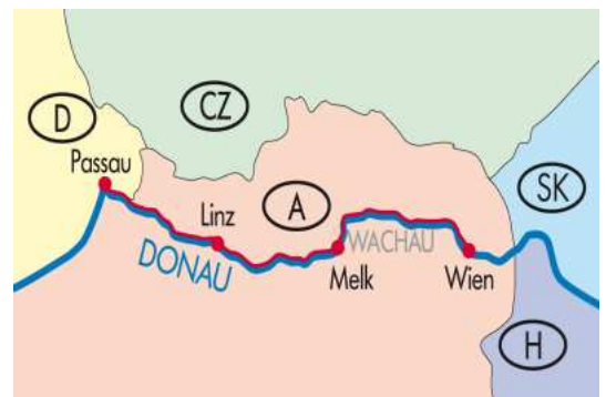
Donauradweg/Danube Cycle Path Passau-Wien Bummlertour/Passau-Vienna Light